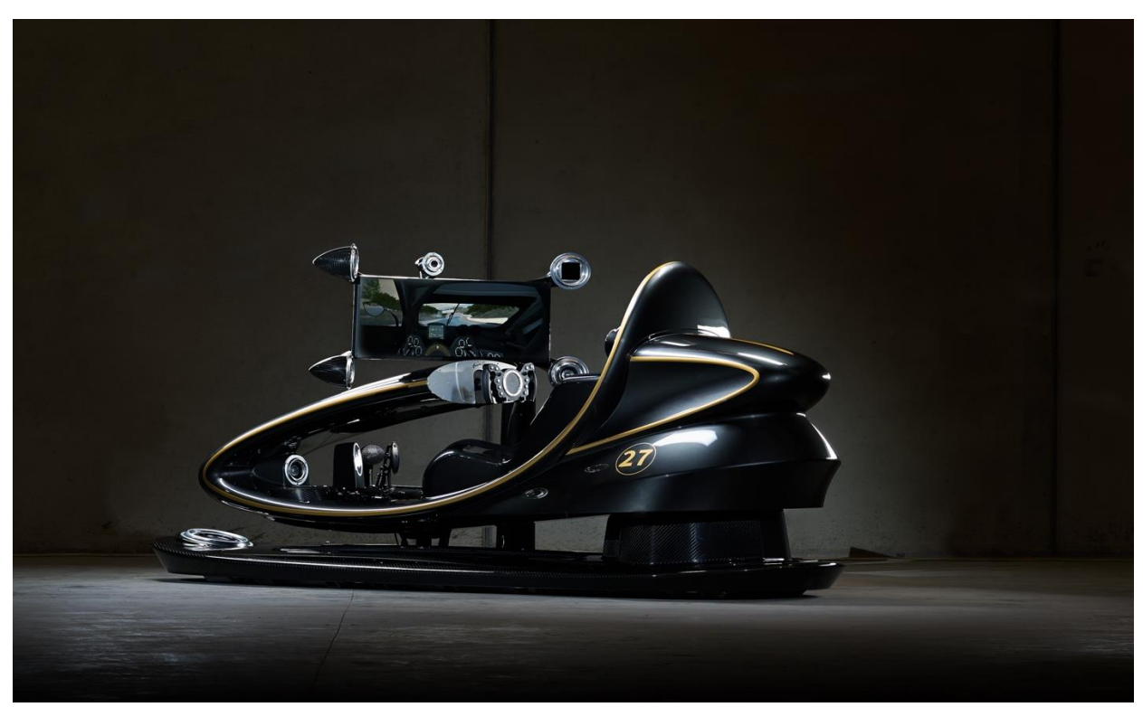
Pagani Huayra R Simulator.